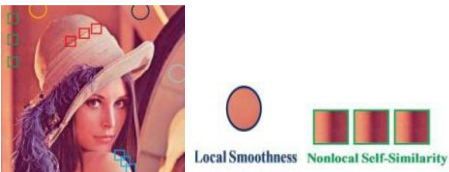
Fig. 1. Illustrations for local smoothness and nonlocal self-similarity of natural images.

The ill-posed nature of image inverse problems, prior knowledge about natural images is usually employed, namely image properties, which essentially play a key role in achieving high-quality images two types of popular image properties are considered, namely local smoothness and nonlocal self-similarity. The challenge is how to characterize and formulate these two image properties mathematically. Note that different formulations of these two properties will lead to different results.